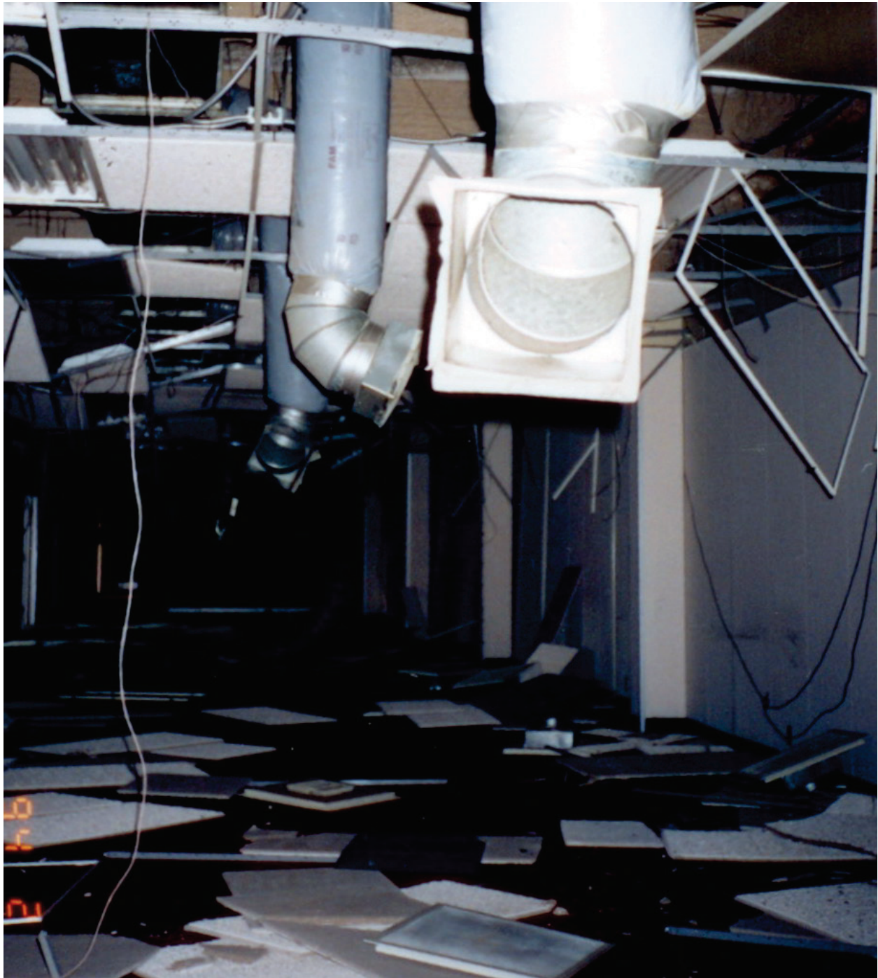
Figure 6.4.6.2-1 Air diffusers fell to the floor; ducts hanging through ceiling grid as a result of the 1994 Northridge Earthquake (FEMA 74, 1994).