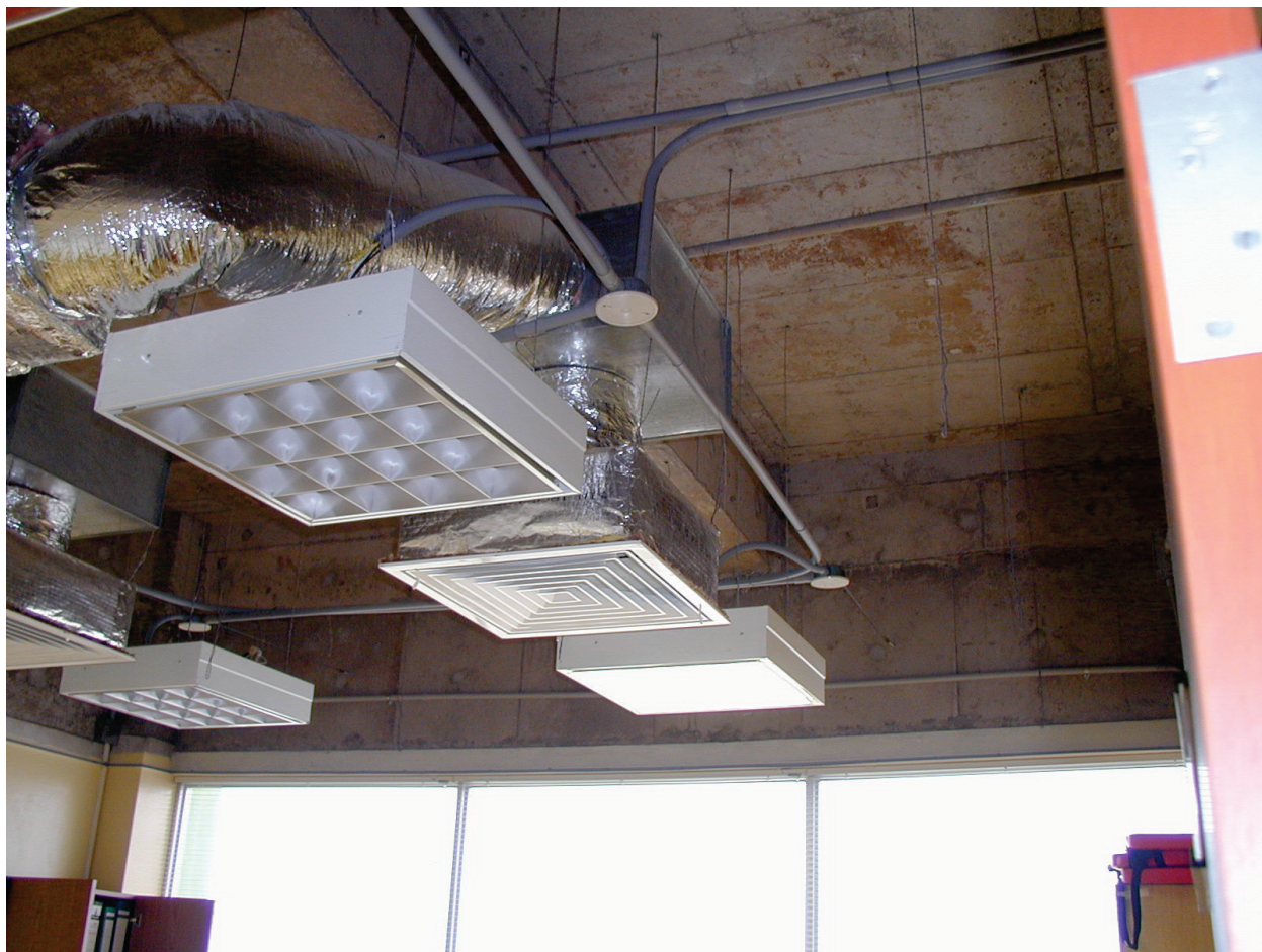
Figure 6.4.6.2-2 HVAC diffuser attached to the structure with four vertical hangers; ceiling system was damaged beyond repair in the 2001 Peru Earthquake but none of the diffusers or lights fell. Ceiling was demolished prior to photo.