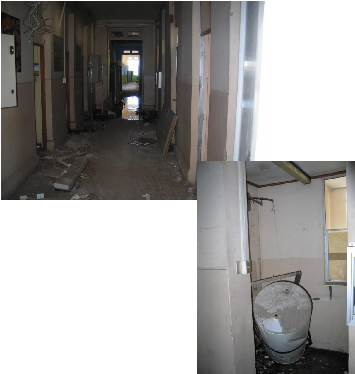
Figure 6.4.2.4-2 Water damage at the Talca Hospital in the 2010 magnitude-8.8 Chile Earthquake; water leaking from tank at right. This building was closed due to nonstructural damage, dominated by water damage.