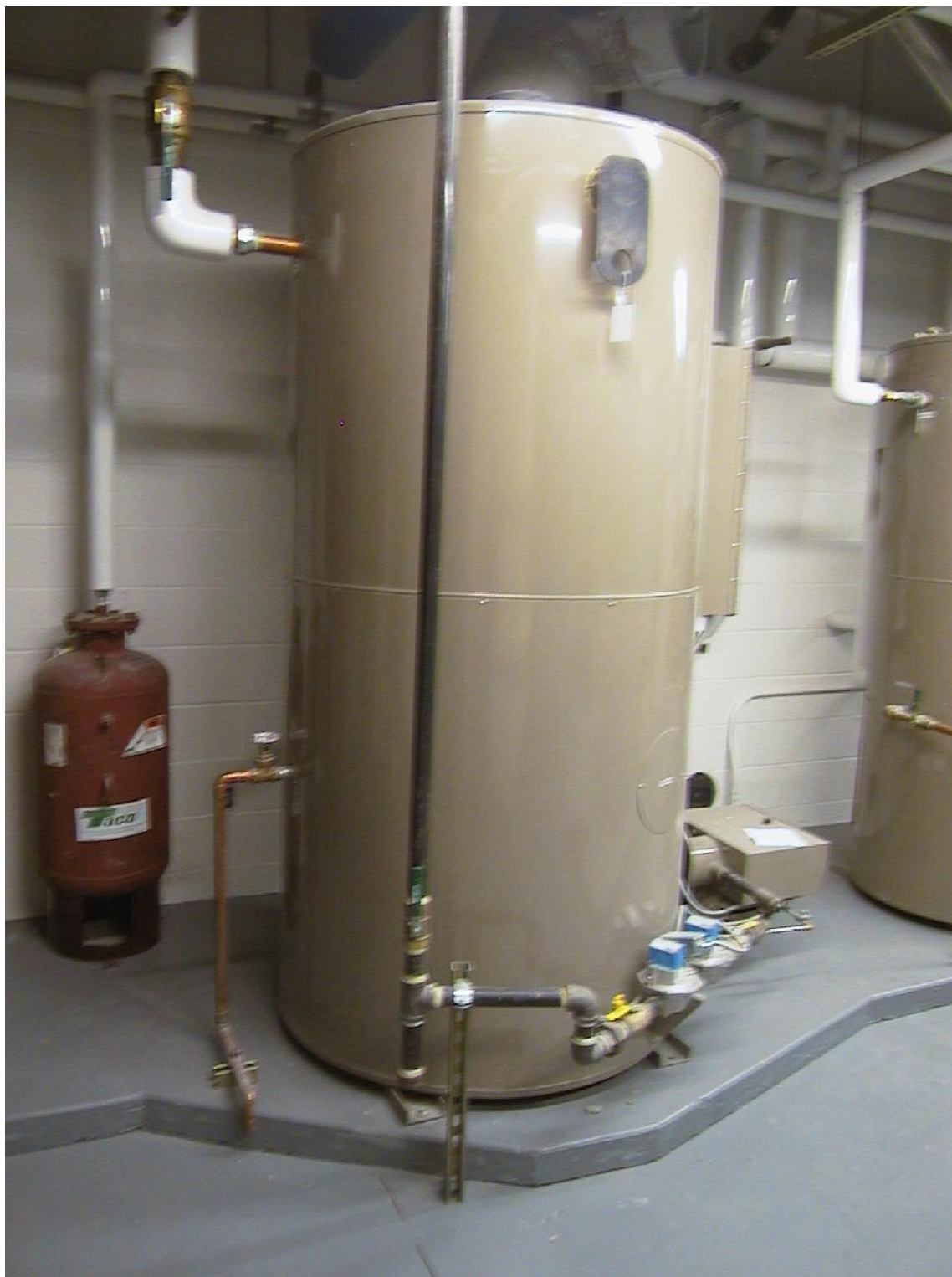
Figure 6.4.2.4-5 Base-mounted water heater located in a school; equipment supplied with metal base for mounting.