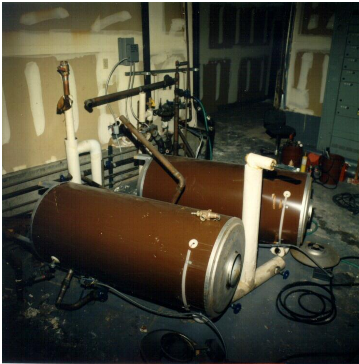
Figure 6.4.2.4-1 Unanchored water heaters overturned.