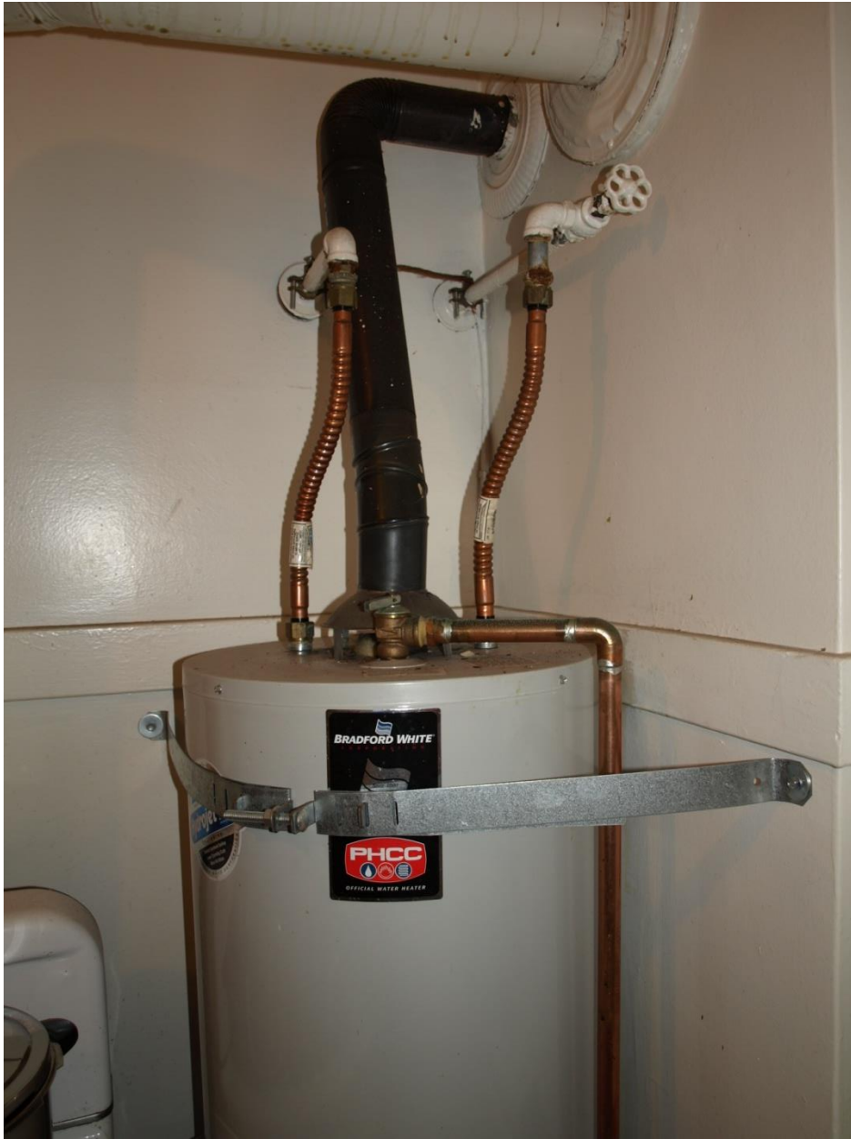
Figure 6.4.2.4-4 Corner installation using a commercially available strap; note flex copper tubing for water hook up.