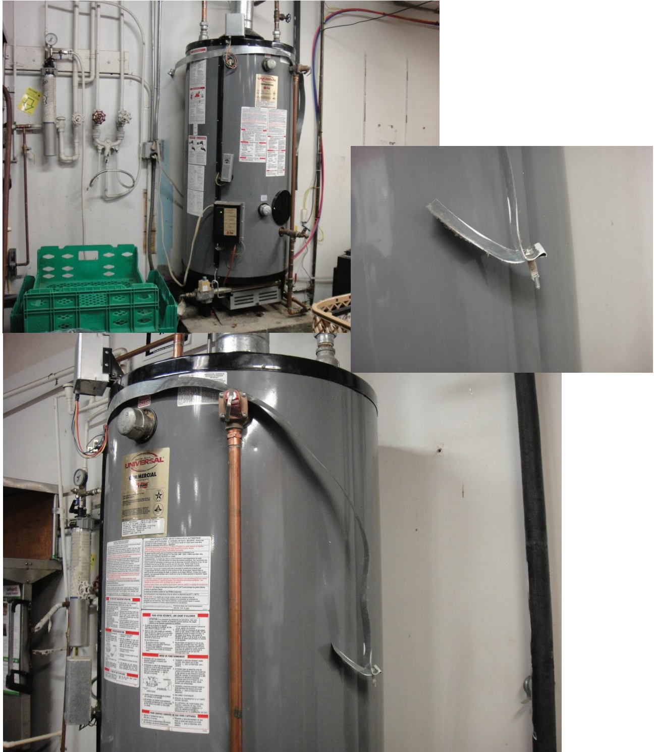
Figure 6.4.2.4-3 Damaged water heater in the 2010 magnitude-6.5 Eureka Earthquake. The water heater strap pulled out from the supporting concrete wall as a result of inadequate anchorage. The tank moved sufficiently to break interconnected water lines which were rigidly connected to the tank.